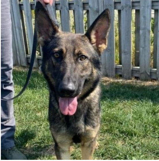
K9 Officer Odin